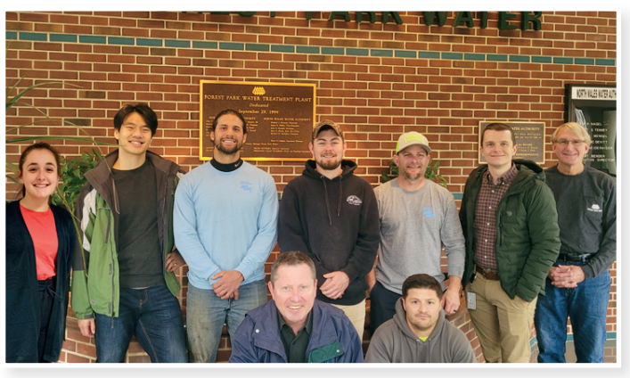
Recently hired NPWA employees received a tour of our Forest Park Water Treatment Plant.

Interestingly, a similar dynamic of turnover is also occurring on NPWA's Board of Directors. For 2022, four of NPWA's 10 Board members, or 40%, have joined the Board less than two years ago, three out of 10, or 30%, have served on the Board for greater than 15 years, and the remaining three of 10, or 30%, have been with NPWA between two and 15 years. This provides NPWA with a similar diversity of perspectives around the Boardroom table, which is a good thing for now and for the Authority's future.