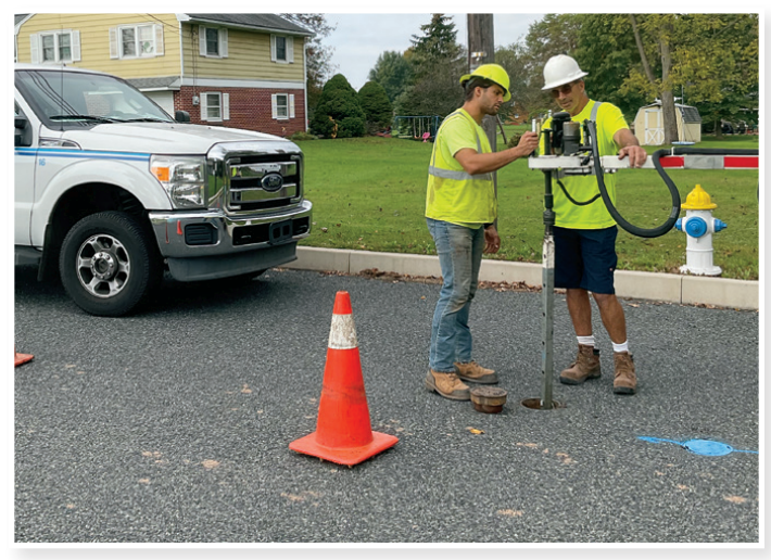
A veteran employee shows a newer employee how to exercise water valves.

These statistics show that NPWA has a staff that is well balanced between "veteran" and "newcomer." The Authority views this as a positive and healthy balance. The commitment, dedication, and loyalty of veteran employees is much appreciated, and their knowledge and on-the-job experience are invaluable. The influx of new employees coming into the Authority brings a fresh perspective. The key is capitalizing on onboarding this next generation of employees who can grow into long-time employees in the future. It's a great benefit for any organization to have a balance of different generations working side by side to achieve a common goal.